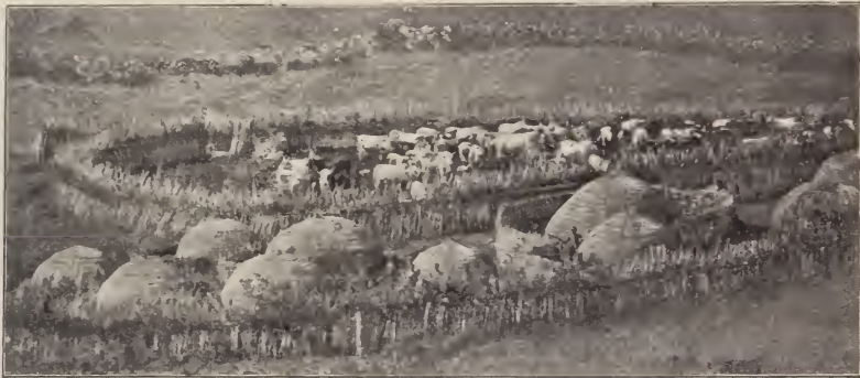
A ZULU KRAAL OR VILLAGE.

long grass. There is no chimney and no window; the door is but two and one-half feet high, so that one must enter on all fours. In this dark hole the people live—often large families in the one room. A saucer-like hole is made in the center for a fireplace, and the earth floor around it is pounded hard. Mats serve for carpets by day and for beds by night, with blocks of wood six inches thick as pillows. The sides of the huts are usually pretty well covered with ox-hide shields, once carried in war, and handed down as heirlooms. The remainder of the furnishings consists of calabashes, or water-pitchers, cooking utensils, and the two stones for crushing the corn.